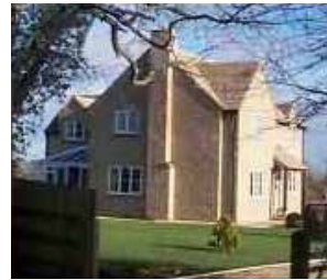
Wheatleys Farm High Road, Ashton Keynes, Swindon SN6 6NX T: 01285 861310

FOR MORE INFO VISIT: www.english-inns.co.uk