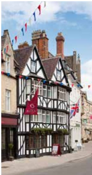
The Fleece Hotel Market Place, Cirencester GL7 2NZ T: 01285 658507

FOR MORE INFO VISIT: www.wheatleysfarm.co.uk