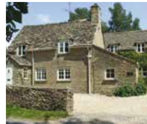
Well Cottage B & B Ewen, Cirencester, Gloucestershire GL7 6BU T: 01285 770212

FOR MORE INFO VISIT: www.cotswoldwaterparkhotel.co.uk/