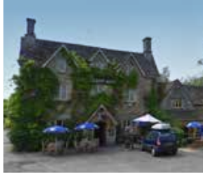
The Elliot Arms Clarks Hay, South Cerney, Cirencester, GL7 5UA T: 0870 330 5125

Our training facilities are based at our UK HQ in the Cotswold Water Park near to Cirencester, Gloucestershire. If you require accommodation, we can recommend several options in the area, from excellent traditional Cotswold pubs, to town centre hotels - the area is fantastic for good food and relaxing evenings. Do browse through the listed sites below: